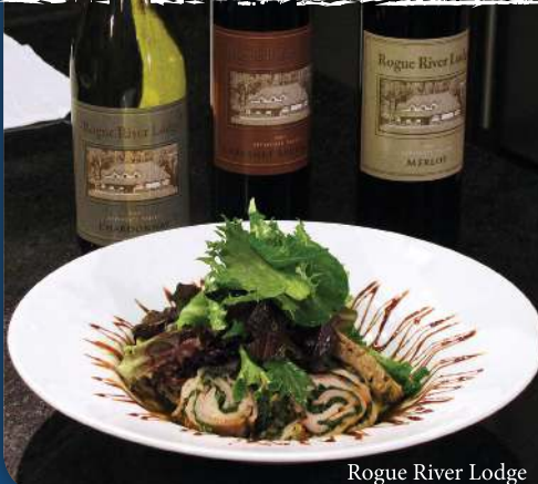
Rogue River Lodge