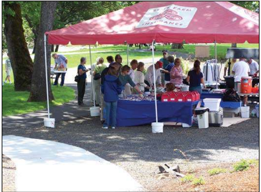
No sooner was Harnish Wayside dedicated, the first community wide event, Picnic in the Park was held to benefit Eagle Point youth programs.

forms will be provided for your ad commentary, and your business information is needed for any race sponsorship. The deadline for race sponsorship is Friday, June 6.