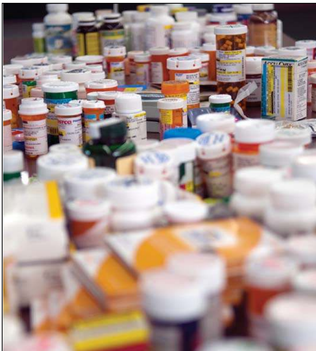
Prescription drugs of every shape and color were brought in to be disposed of at the Chamber sponsored Drug Turn In Event.