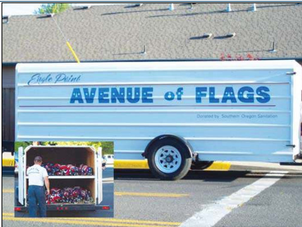
The Avenue of the Flags new trailer donated by Southern Oregon Sanitation. Inset shows how the flags are stacked inside the trailer.