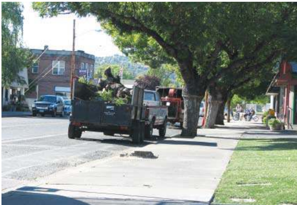
Trees have fallen, concrete and asphalt have been ground up and hauled away but soon the work in downtown Eagle Point will be complete.

We encourage a strong showing from the Chamber.