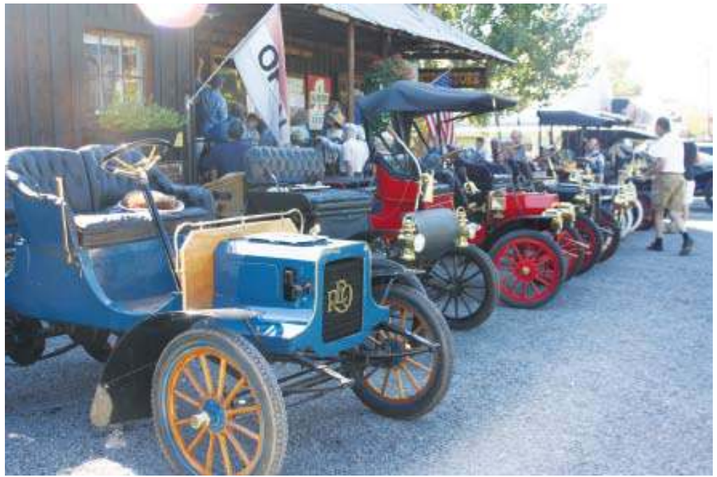
Members of the Horseless Carriage Club of America stopped at Butte Creek Mill last Wednesday as part of a southern Oregon tour of the Single Cylinder Club. The autos were marketed between 1890 and World War I.