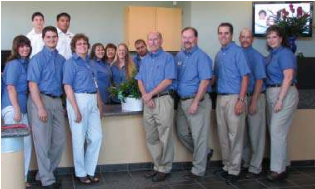
The staff at the new Rogue Federal Credit Union in Eagle Point.