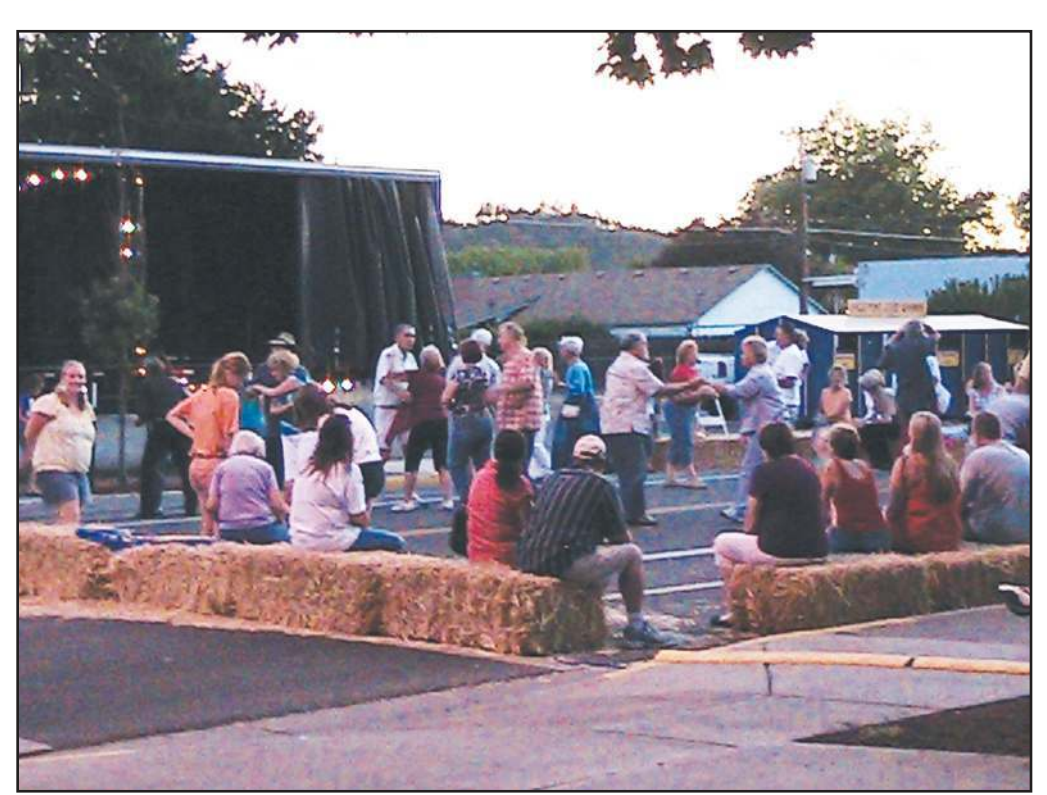
About 300 turned out for the 2nd annual Eagle Point street dance & BBQ.