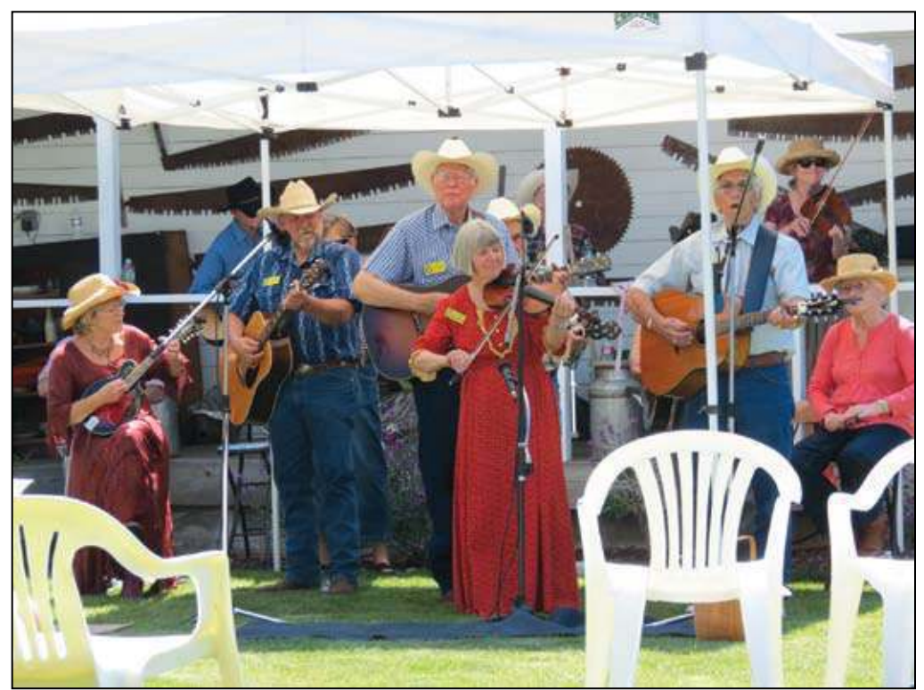
Vintage Faire is just around the corner, reserve your spot today. Last year the Old Time Fiddlers were just one of the many entertaining events at the Faire.